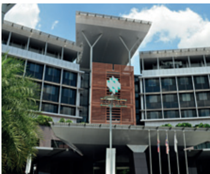
Prince Court Medical Center