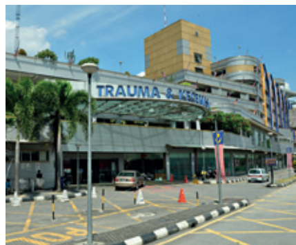
University Malaya Hospital

Many architects, planners and decision makers have already discovered the benefits of our special products.